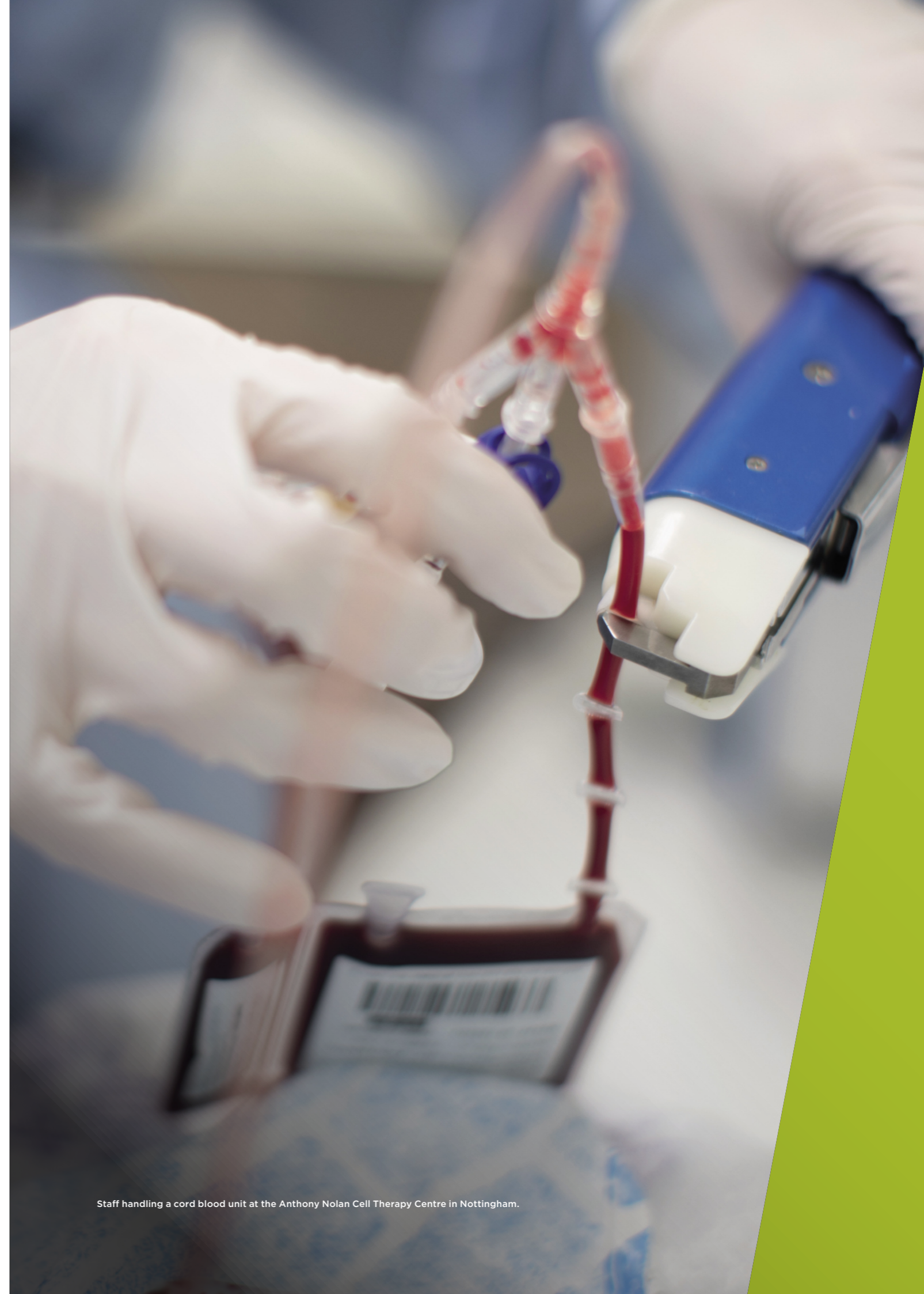
Staff handling a cord blood unit at the Anthony Nolan Cell Therapy Centre in Nottingham.

with them in a meaningful, appropriate and timely way to enable us to have more impact for patients. We will be looking at systems, culture and ways of working that can further deepen our relationships.