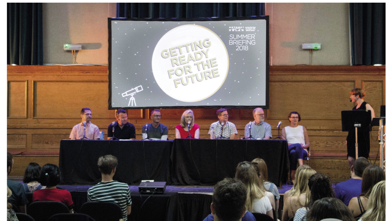
Our Senior Leadership Team answering questions at the annual Staff Summer Briefing.