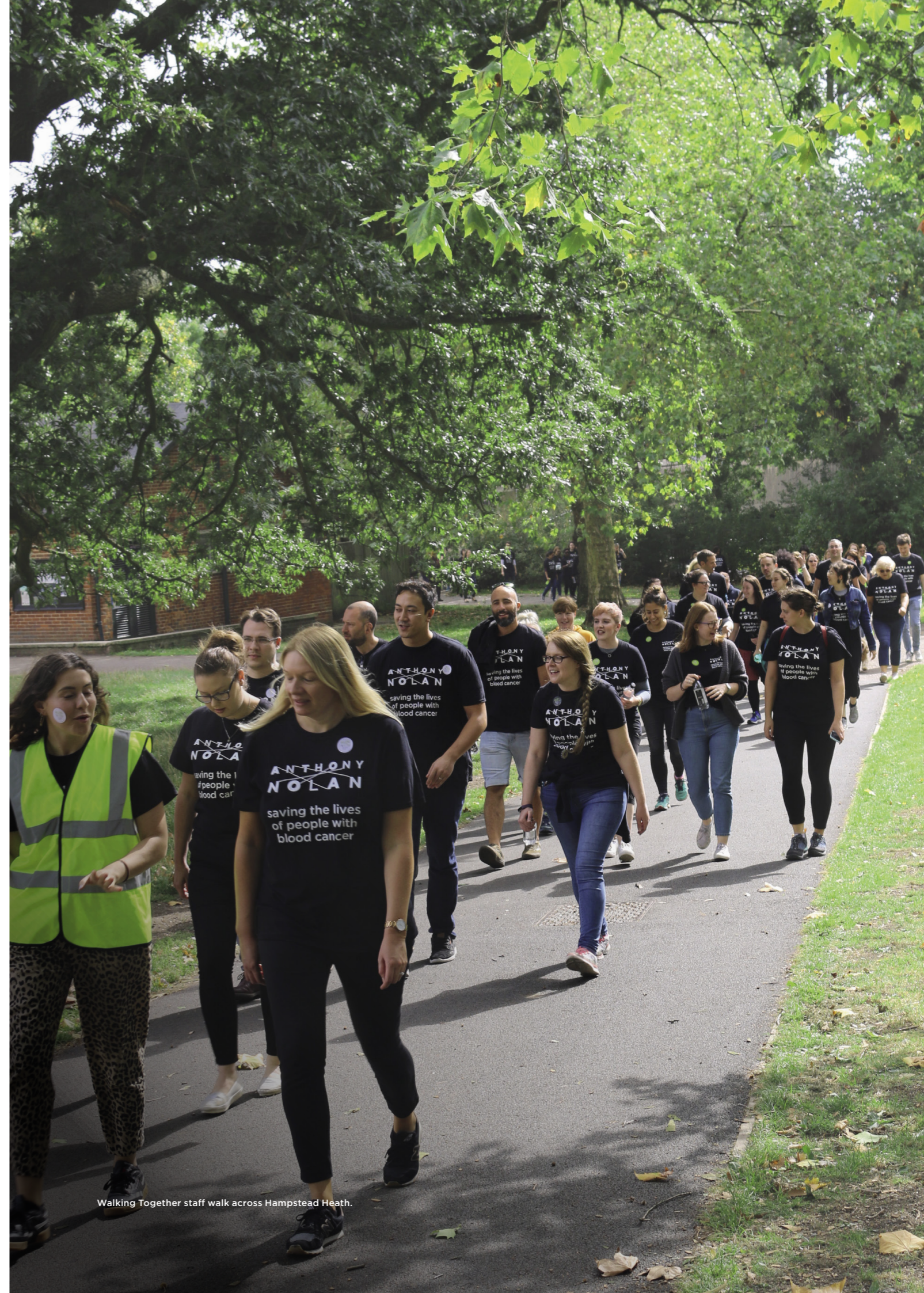
Walking Together staff walk across Hampstead Heath.

55 supporters organised Walking Together events across the country.