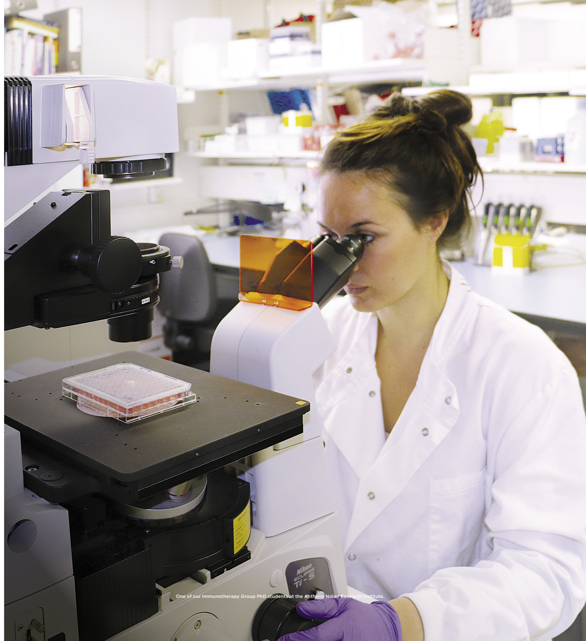
One of our Immunotherapy Group PhD students at the Anthony Nolan Research Institute.

What follows are some of the ways we have been collaborating with, leading and influencing the transplant community in 2018/19.