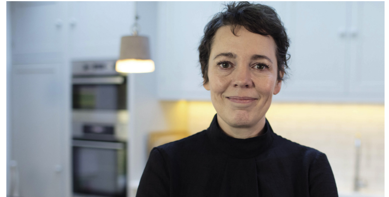
Our Patron Olivia Colman CBE.

1,425 people with blood cancer and blood disorders were given a second chance of life.