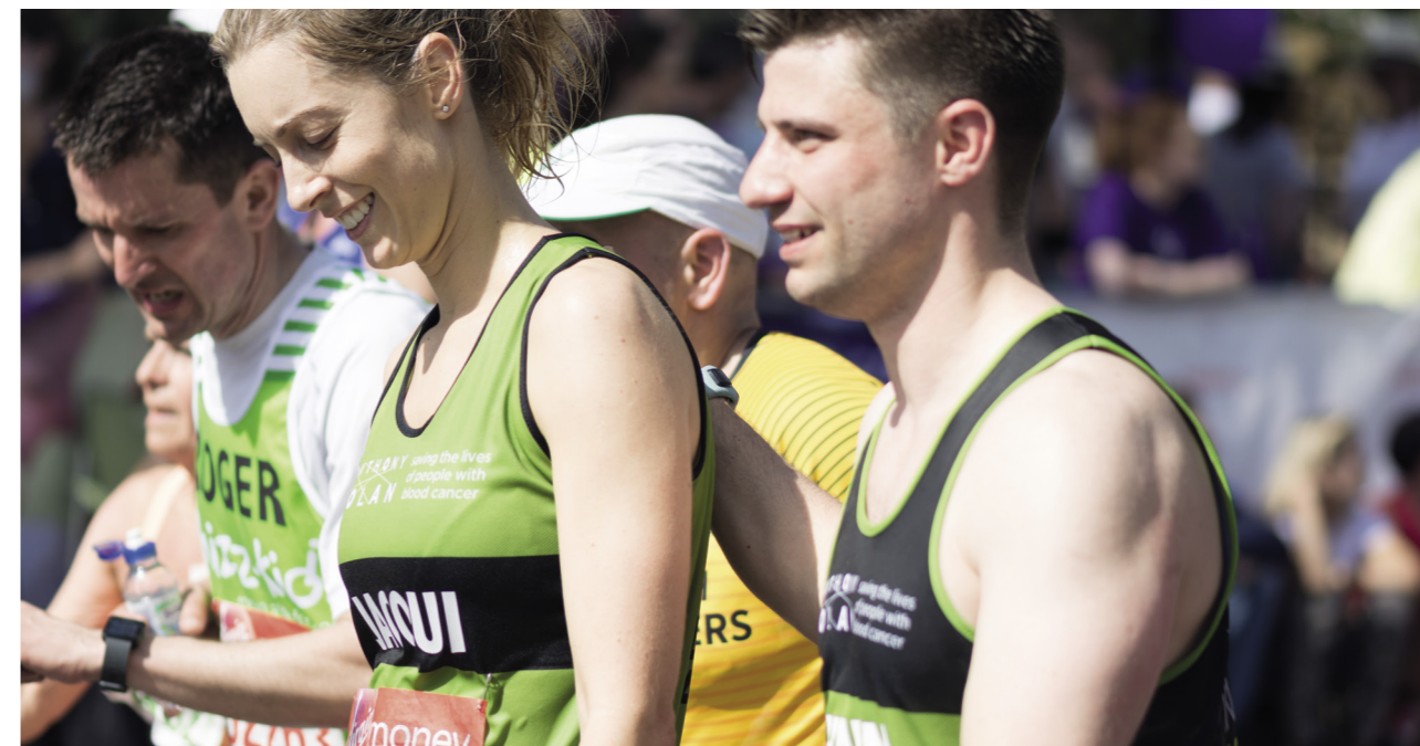
#TeamAN runners at the London Marathon.

£590,000 was raised by Team Anthony Nolan taking on the London Marathon in 2018.