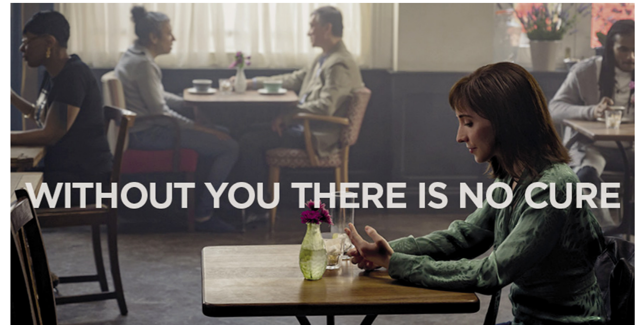
Frame of the Brand Awareness Campaign video Without you there is no cure.