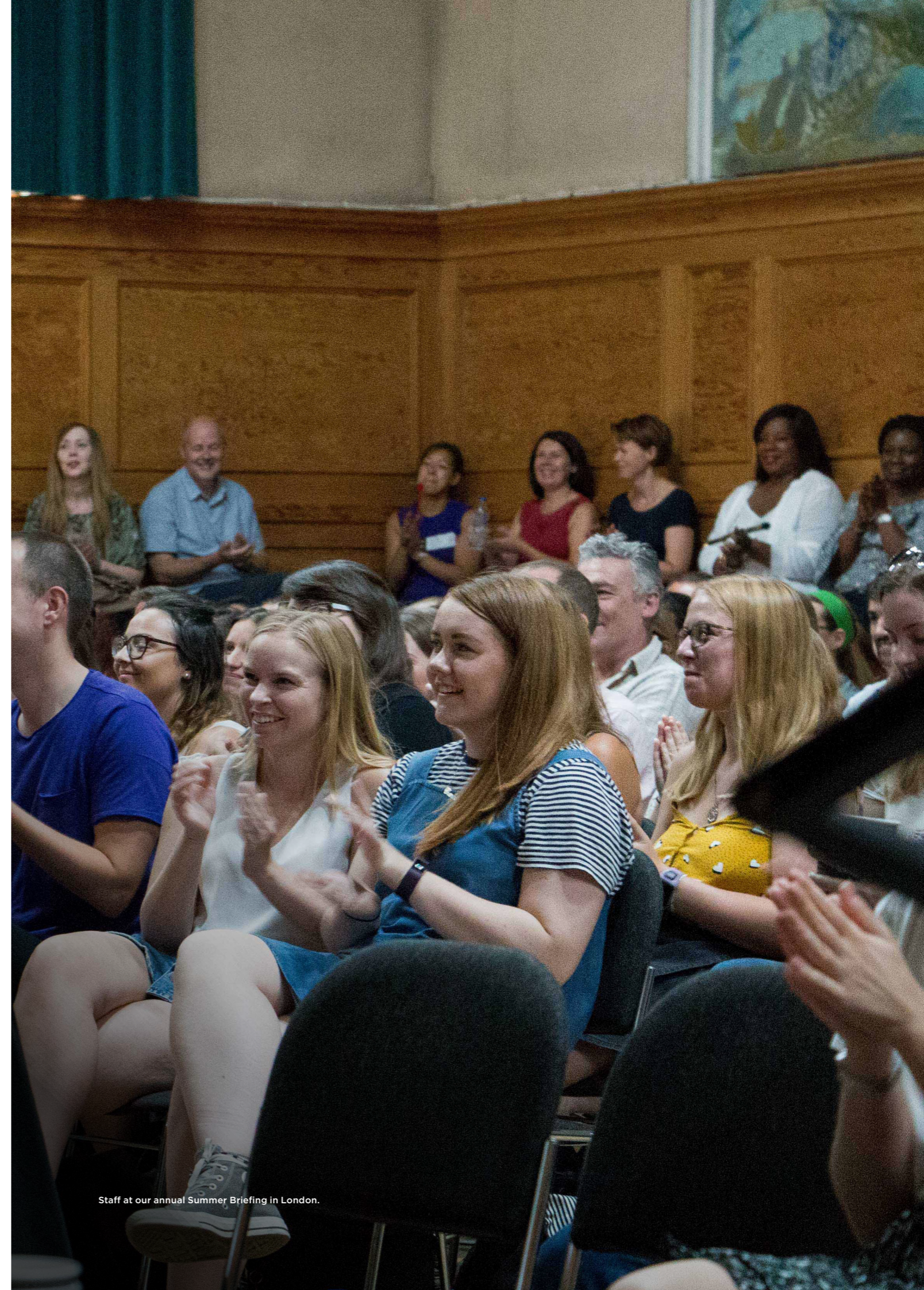
Staff at our annual Summer Briefing in London.