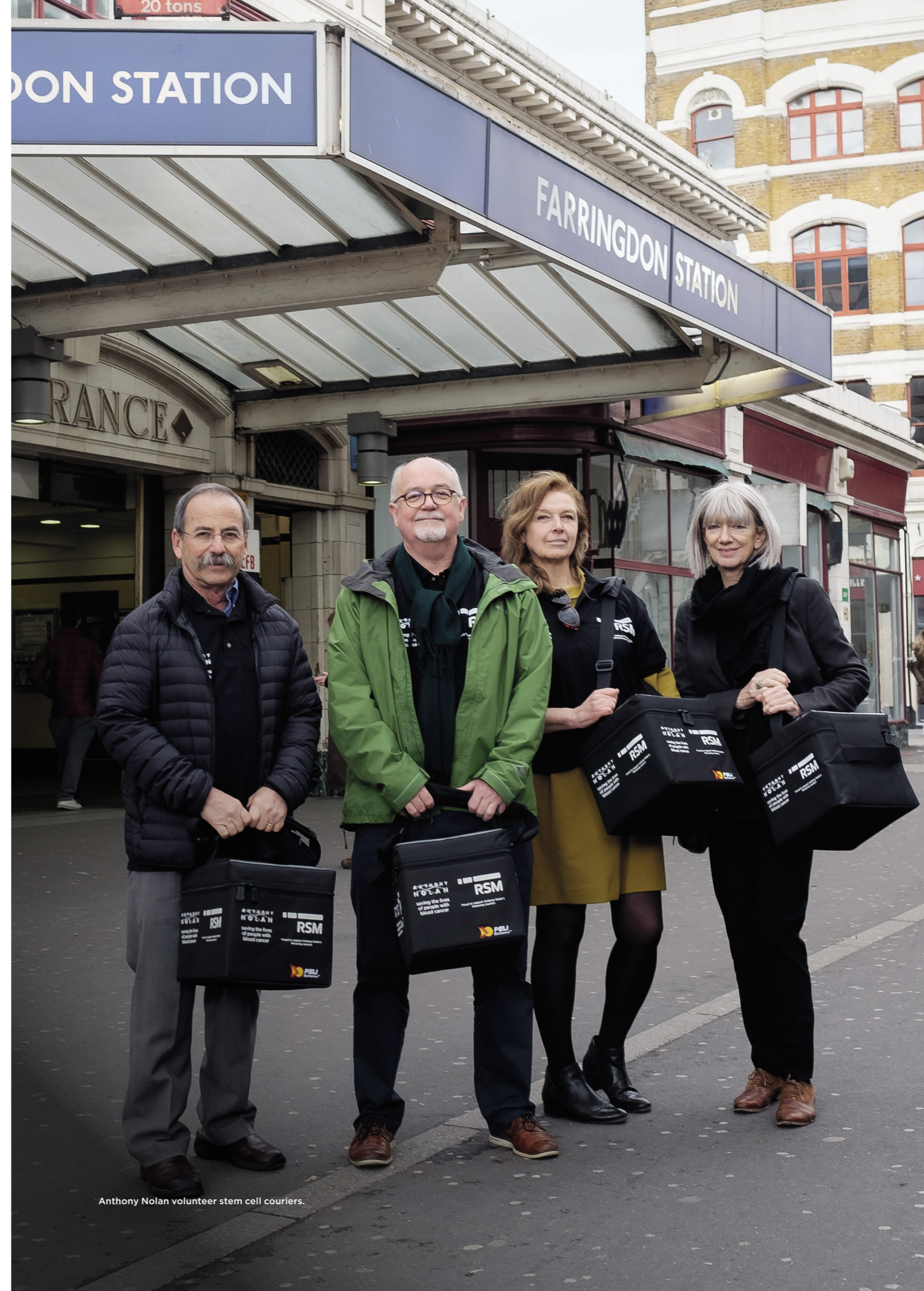
Anthony Nolan volunteer stem cell couriers.

62 volunteer couriers travelled over 463,000 miles around the world to collect and deliver stem cell donations to patients here in the UK.